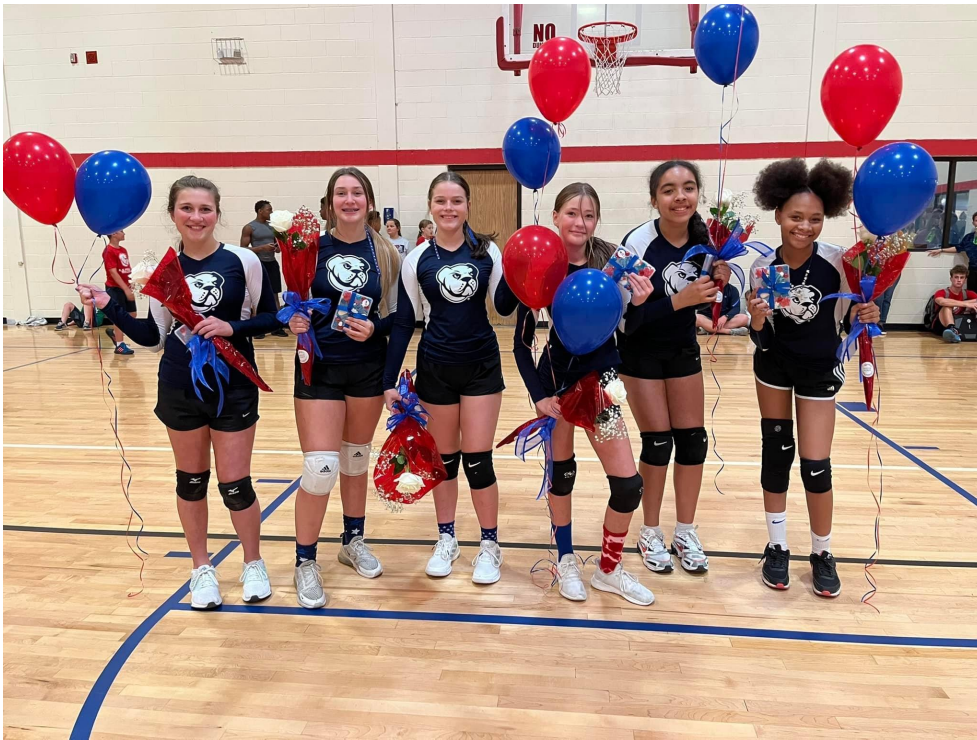
8th Grade Girls at their last AEP Volleyball Match