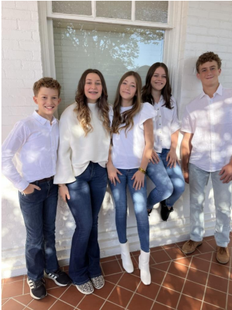
EIGHTH GRADE PICTURES