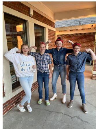
WINNERS OF THE RED RIBBON POSTER CONTEST