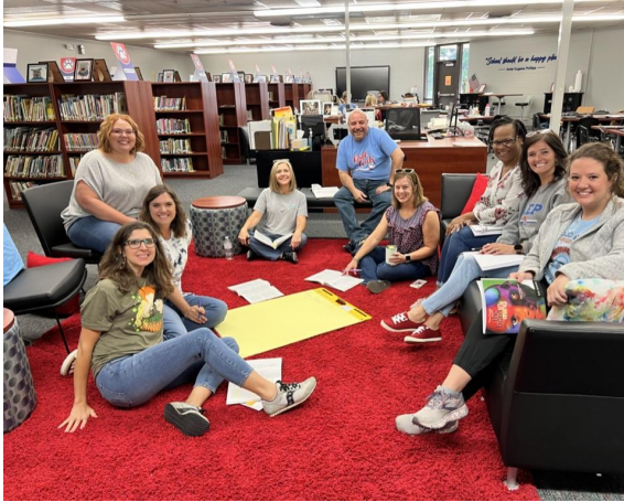
Middle School Teachers researching Teaching with the Brain in Mind.

INTENTIONAL. As we continue with our theme of this year, AEP Middle School teachers have been INTENTIONAL in the month of October planning for our students and learning how they learn. For the last year, our teachers have been participating in a book study. This book study has been focused on brain research and how to apply this research in the classroom. Students may spend more than